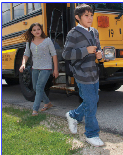
CATHOLIC SCHOOL children can get tuition assistance through KofC.